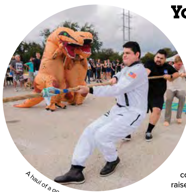
A haul of a good time in Austin.

Want to make a difference for people and pets? We're hiring! Visit emancipet.org/careers